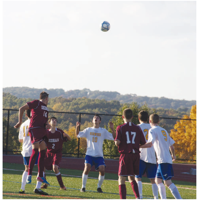
A Dedham player heads the ball well wide of the net. The Marauders would best the Mustangs with a 3-0 win.

All seniors got some playing time that day, but it wasn't enough to add up to a win for the Mustangs.